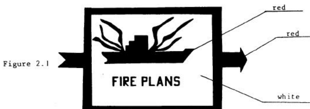
Figure 2 - Guide sign

2.3 If the enclosure is not adjacent to the gangway, there should be guide signs to help the shoreside fire-fighting personnel to find the enclosure containing the fire control plans. The guide sign should be the location sign defined in paragraph 2.2 with the addition of a red arrow (figures 2.1 or 2.2, at the discretion of the Administration) showing the direction where the fire control plan enclosure can be found.